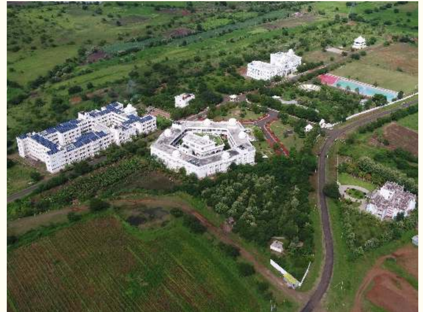
A bird's eye view of Sri Sathya Sai University for Human Excellence, Kalaburagi Campus, Karnataka