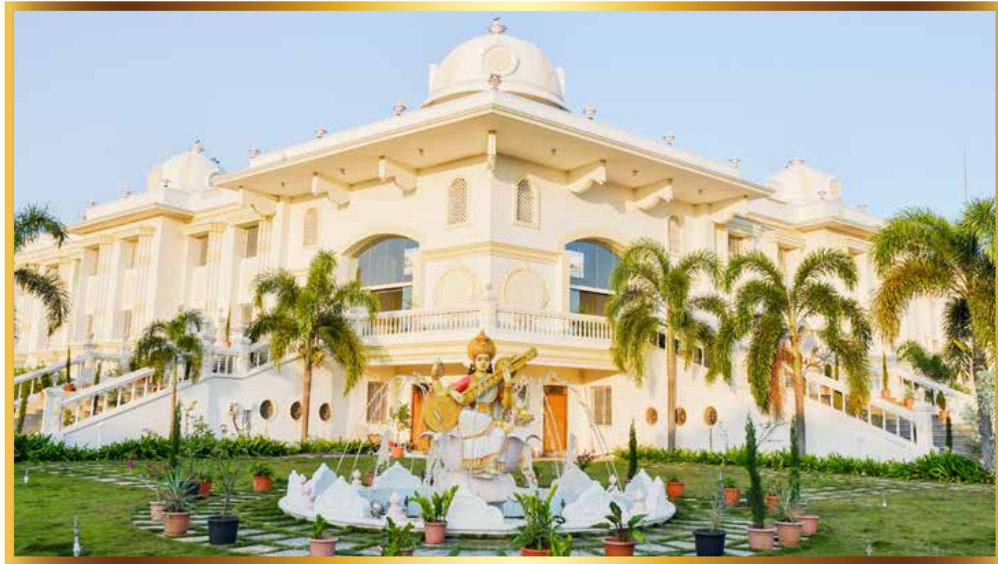
Sri Sathya Sai University for Human Excellence Central Campus, Kalaburagi, Karnataka